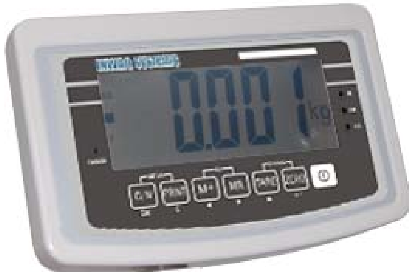
Figure 2 Vegas indicator.