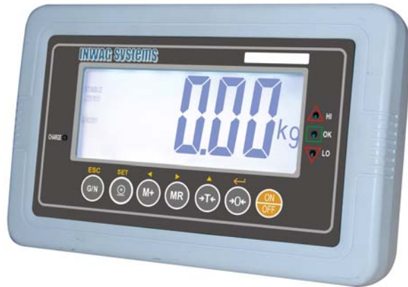
Figure 3 California indicator.