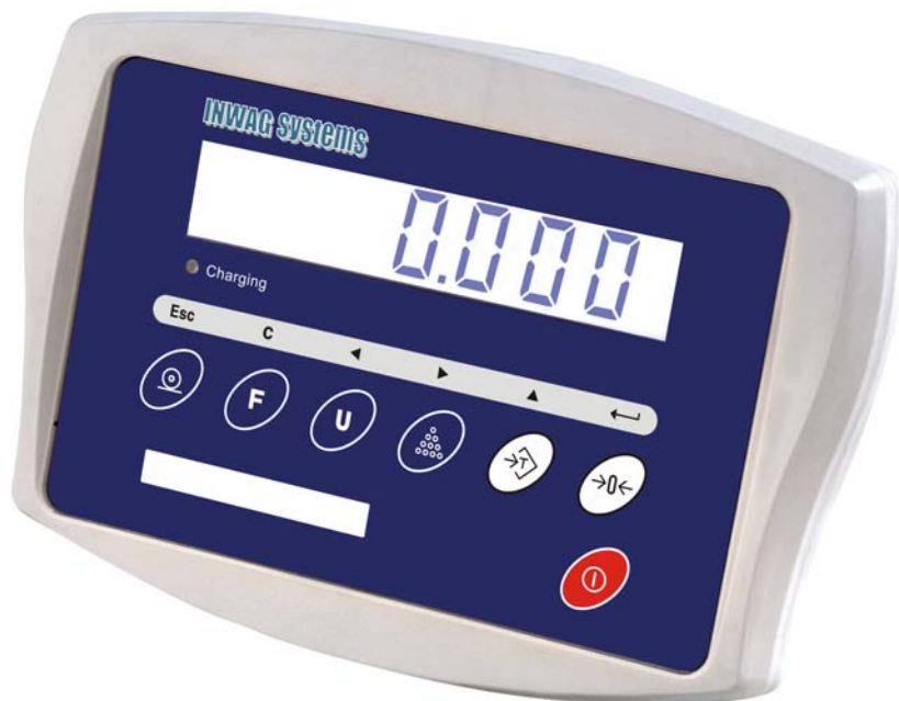
Figure 4 Kansas indicator.