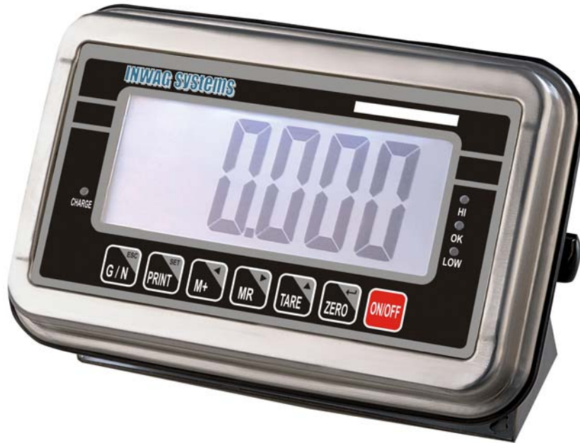
Figure 1 Boston indicator.